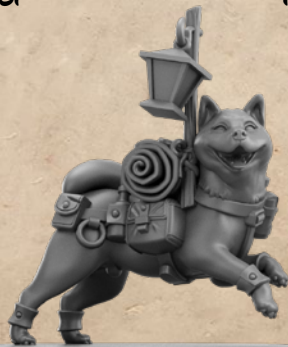
Kai, Shiba Inu Ranger