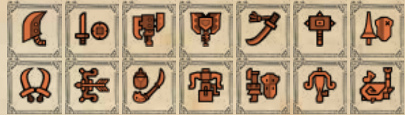
Orange symbols are rarity 5 weapons.

To slay the strongest elder dragons, you'll need even more powerful equipment.