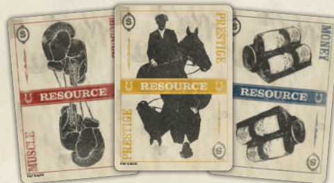
54x Resource Cards 18x Muscle, 18x Prestige, 18x Money