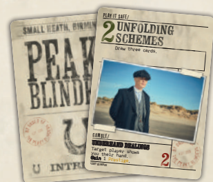
32x Intrigue Cards