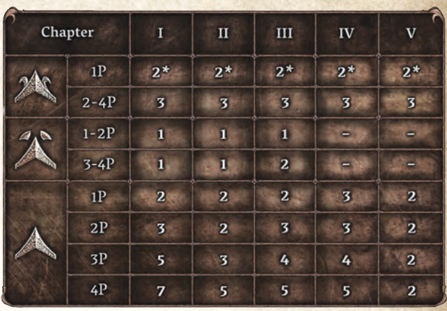
* The specific Fixed Map tiles for the Solo Game can be found in the Rulebook, page 31 .

At the beginning of rounds 6 and 11, return the current Event card into the box and reveal the next card from the Event deck. The first two Initiative tokens on the Round track remind you of this.