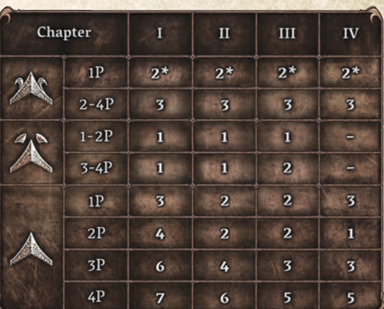
* The specific Fixed Map tiles for the Solo Game can be found in the Rulebook, page 31 .