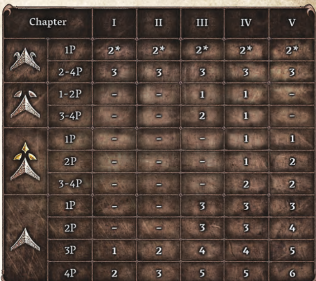
* The specific Fixed Map tiles for the Solo Game can be found in the Rulebook, page 31 .