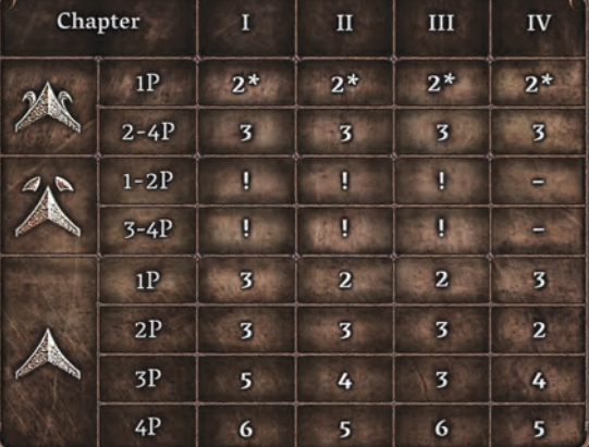
* The specific Fixed Map tiles for the Solo Game can be found in the Rulebook, page 31 .