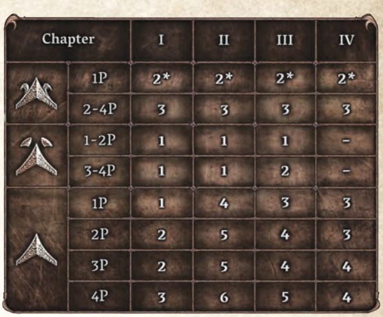
* The specific Fixed Map tiles for the Solo Game can be found in the Rulebook, page 31 .